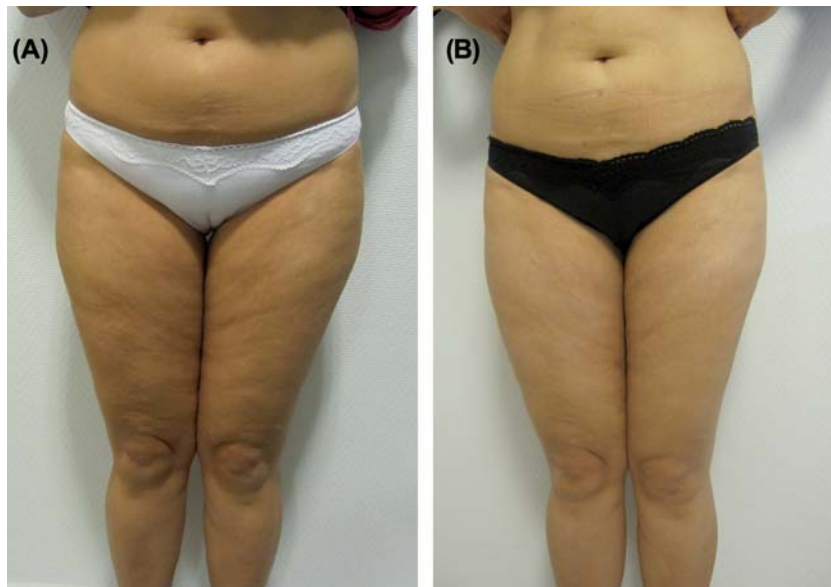
Figure 3. One of highly satisfied patients, before (A) and after (B).

which we obtained a significant reduction. Interestingly, when looking at the results obtained from both ours and the study carried out by Guleç, we noticed that there was no improvement after LPG treatment sessions in patients with Grade 1 cellulite, although this finding has not been mentioned or emphasized in other LPG studies. Thus, further studies of LPG in patients with Grade 1 cellulite seem to be needed in order to contribute the debate of efficacy of LPG in patients with early stage of cellulite.