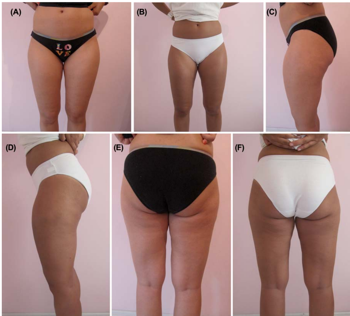
Figure 2. Cellulite improvement and tightening before (A, C, E) and after (B, D, F) photographs of the same patient.

The other differences that distinguished this study from the previous ones were in performing a worldwide accepted cellulite grade and adding another three additional body sites (arm, breast, and subgluteal regions) for body circumference measurements. Thus, the findings of this study supported the conclusions obtained from the reduction in body circumference measurements and improvement in cellulite grading regarding the studies on LPG. Moreover, based on the evidence obtained from the previous studies, except for one patient, we also detected the reduction in body circumference measurements even in 14 (12%) patients who gained weight during the study. Furthermore, this study is considered to be the first to measure BFP in