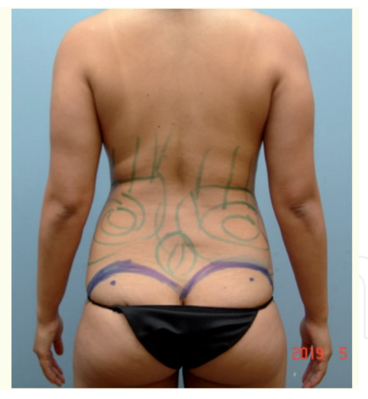
Figure 2. Example of topographic marking for circumferential trunk liposuction. Thin areas are marked in red.

A standard series of photographs are taken prior to marking the patient ( Figure 1 ).