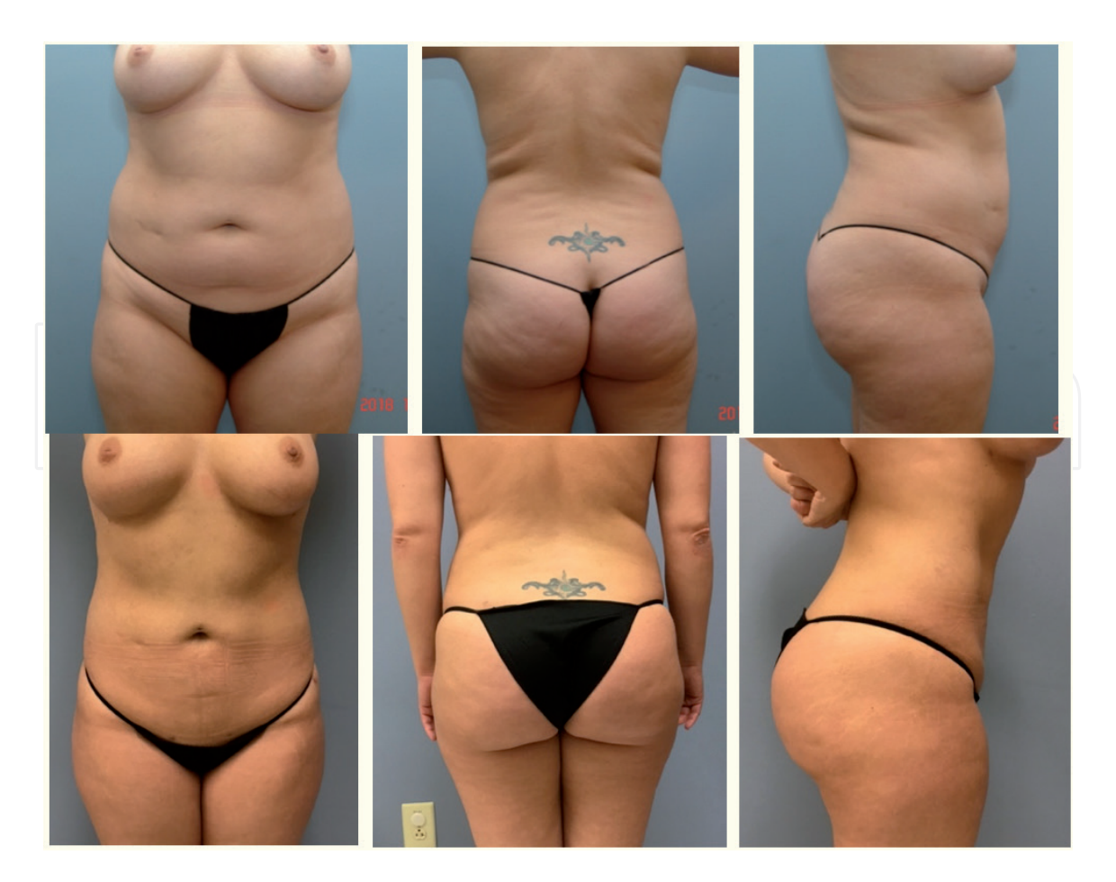
Figure 3. Preoperative photographs. Patient is shown 3 months postoperatively with significant improvement in abdominal contour.

and repair of her diastasis. She underwent circumferential trunk liposuction and full abdominoplasty with rectus muscle plication. VASER was used to treat the posterior trunk ( Figure 5 ).