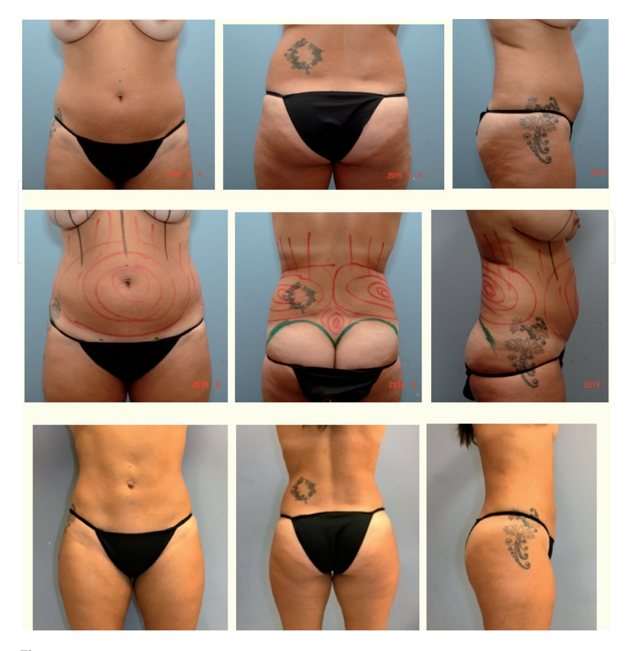
Figure 4. Preoperative photographs and markings. Patient shown 5 months postoperatively with excellent contour and skin contraction.

showering, which is permitted on postoperative day 2. It is recommended that patients wear some form of compression for at least 6 weeks postoperatively. Drains are removed once the output is less than 25 cc per day for at least two consecutive days.