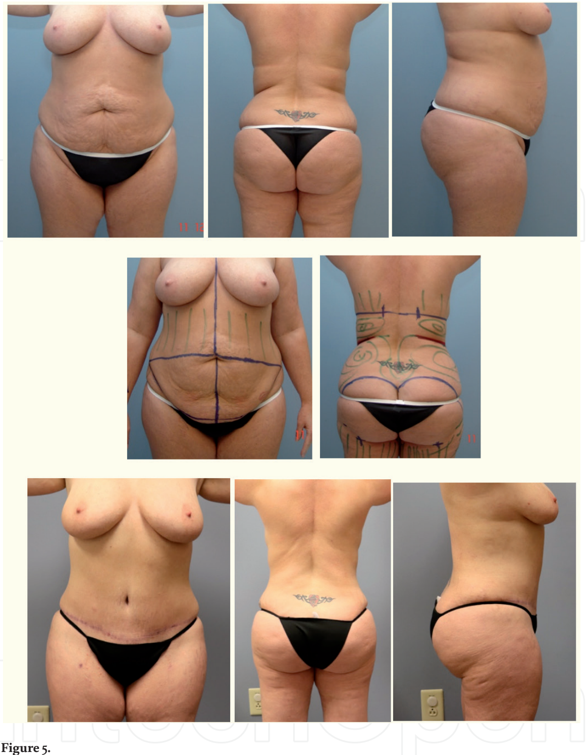
Preoperative photographs demonstrating skin excess and abdominal striae. Postoperative result at 6 months with improved contour.

Contour irregularities may be treated with manual lymphatic drainage (MLD) or Endermologie when mild. Endermologie and MLD help reduce postoperative edema and soften areas of firmness. More significant irregularities may be addressed with Kybella or touch up liposuction.