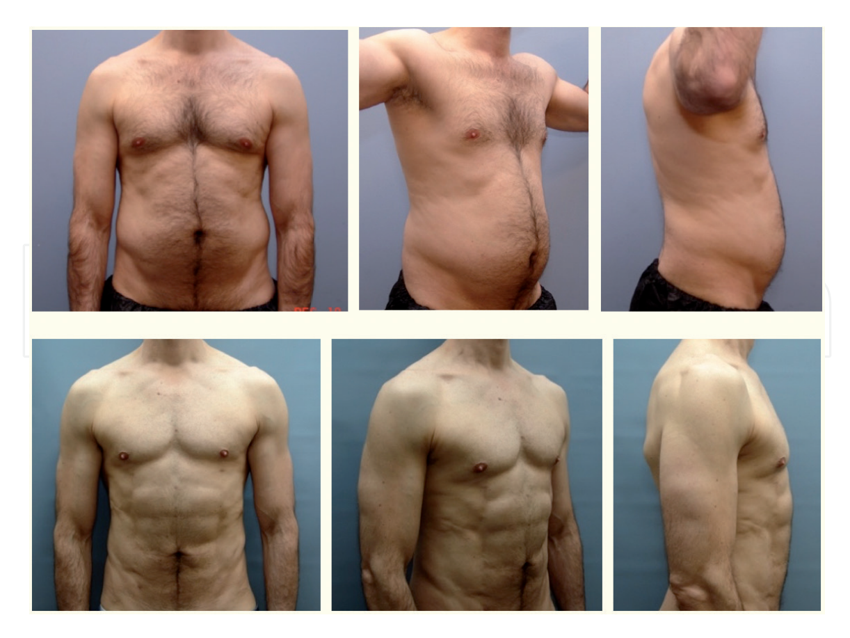
Figure 6. Preoperative photographs and 3 month postoperative photographs are shown.